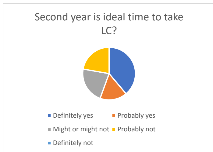
Figure 2. Respondents' opinion if second year is ideal for taking the Neuroscience LC. Blue: Definitely yes (7, 39%); Orange: Probably yes (3, 17%); Grey: Might or might not (4, 22%); Yellow: Probably not (4, 22%).

“Yes, it definitely made me think of the social aspects on what people think of in regard to neurodevelopmental disorders.”