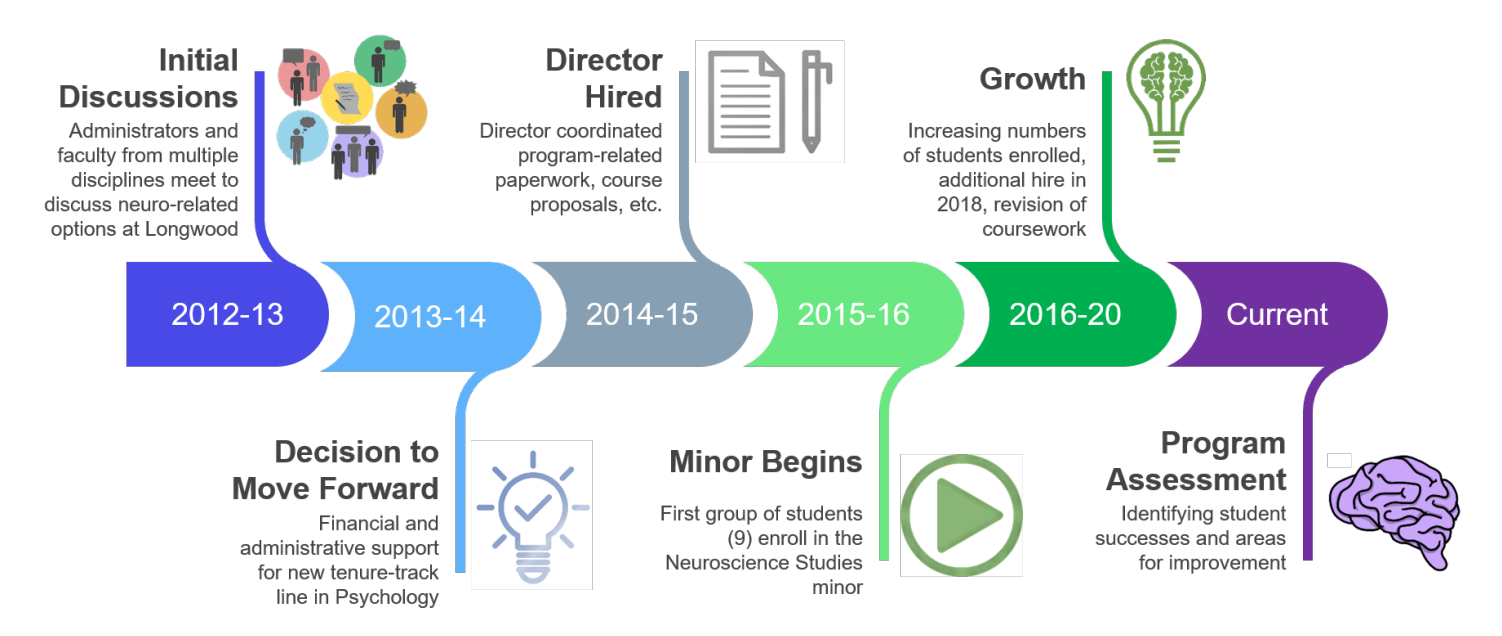
Figure 1. Neuroscience studies minor creation timeline and process.

in BIOL 360 Developmental Biology, how to use our understanding of how our brains work to improve workplace efficiency in MANG 362 Organizational Behavior, and application of neuroscience to creating circuits (and vice versa!) in PHYS 341 Electronics. These elective courses were selected and audited regularly through small group discussions between the director and representatives of each individual department.