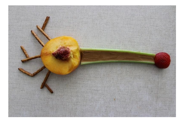
Figure 4. Example of healthy choice edible neuron model using pretzel sticks as dendrites a peach half as a soma in cross section, with the pit representing a nucleus. Celery stalk represents myelin sheath in cross section with peanut butter representing axon and a strawberry as an axon terminal.

Our NS students obtained a set of alcohol impairment simulation goggles (e.g., 3B Scientific, Tucker, GA) from our campus public safety office. These goggles are typically used for demonstrations with older children, but our NS students found them highly effective for elementary schoolaged children as well, as evidenced by their enthusiasm for participation in the activity. Impairment simulation goggles can be used to help explain the role of visual input in maintaining balance and coordination (Figure 3). In addition, children can gain a simple sense of this aspect of