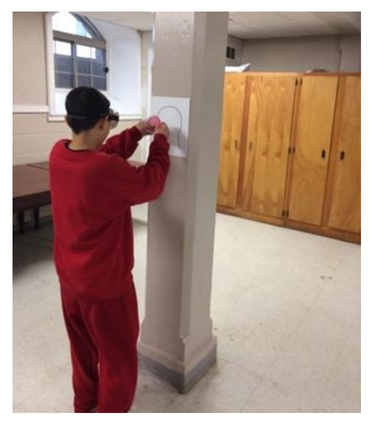
Figure 3. Beer Goggle exercise shows negative effects of drug intoxication using a simple game of pin-the-brain-on-the-skull (à la pin-the-tail-on-the-donkey) while wearing alcohol impairment simulation goggles.

communications may be at least partly responsible for the growing number of children attending our program. Some of the activities that have evoked positive feedback are briefly summarized in the next section. In addition, we are developing a public website where more detailed information will be offered, updated, and linked to other resources including poster presentations summarizing student activities undertaken in each semester of NEUR 215 (State University of New York, 2018c).