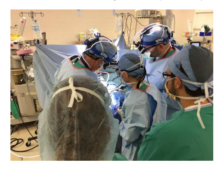
Figure 1. The operating room experience. Students are up-close with the surgery team.

Since many of the enrolled students (>80%) are striving for admission to medical school, we include three activities that educate and inform them along this career path. Firstly, we