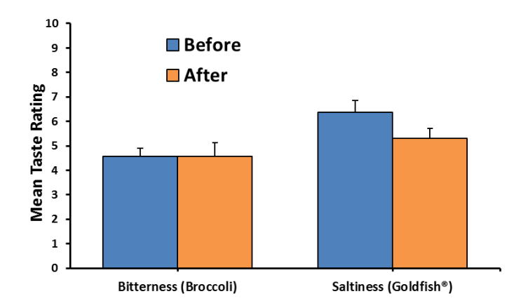
Figure 1. Mean (+SEM) taste rating for the bitterness of broccoli and the saltiness of Goldfish® reported before (blue bars) and after (orange bars) the Miracle Fruit was consumed. Miracle Fruit consumption had no significant effect on the rating of each food item (p > 0.05).

The "Miracle Fruit" laboratory exercise is an excellent activity to reinforce course material related to the sensation and perception of taste. During this exercise students recorded their perceived intensity of sweet and sour tastes for various food items before and after they consumed a Miracle Fruit berry. The data students collected and analyzed revealed that miracle fruit consumption robustly alters the taste of sour foods to become sweeter and less sour. The results also showed that chewing on the Miracle Fruit had little effect on the perception of non-sour food items. Interestingly, the fact that the perception of sourness is decreased appears to be a central perceptual phenomenon. Miracle Fruit does not have any physical effect on the sour taste receptor (Kurihara and Beidler, 1969). The change in perception of sourness without physical alteration of the receptor demonstrates the psychophysical nature of human senses.