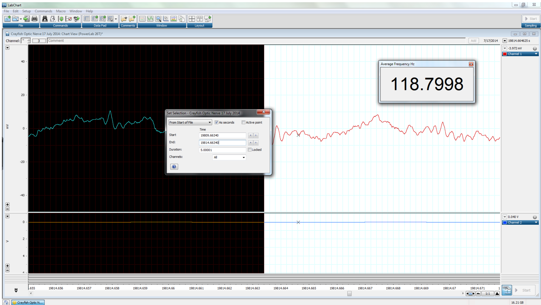
Figure 15. Screenshot taken within LabChart® displaying how to use the Set Selection window and observe values displayed in the Average Frequency Hz miniwindow.