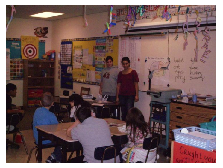
Figure 1. Undergraduate students giving a lesson on the brain to an elementary school classroom as part of the Neuroscience Community Outreach Project.

K-12 Education: Many students interested in pursuing teaching careers chose to make presentations to K-12 classrooms. This gave students a chance to connect their neuroscience and education training, and also brought students into contact with web sites and neuroscience teaching resources they could access in the future (e.g., Neuroscience for Kids, Chudler, 2010). Figure 1 shows students making a presentation to an elementary classroom. In preparing their classroom visits, students considered effective ways to engage younger students, including the use of hands-on demonstrations and relating neuroscience information to age-appropriate topics. Students already taking education courses often aligned their presentations with state content standards and/or included curriculum staging (e.g., presentation, independent student practice, review) and evaluation of students' learning. One group of students chose a more curricular-focused project and designed a weeklong curriculum with five daily lessons to be used by first grade teachers during Brain Awareness Week. The curriculum included background information for the teacher, activities and handouts for students, and links to multimedia resources. Materials were available as both a hard copy packet and as a self-contained CD. We are in the process of making these lessons available on the web for teachers.