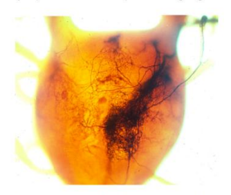
Figure 18. An insect ganglion with a single nerve placed in cobaltous chloride, which produces a backfill effect via diffusion that allows for the visualization of the neuropile.

Let's consider again visualizing neurons. An effective method used is backfilling the neuron through the axon with cobaltous chloride (Fig. 18). In this technique, the neuron takes up the solution by diffusion and over time labels the neuron's complete region of synapses in the neuropile of the ganglion.