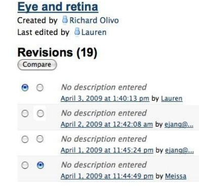
Figure 2. For each page, a wiki allows comparison of different versions by selecting two saved versions of the page to compare.

(a) I assumed the class notes would be of high quality because students would be responsive to peer pressure, and authors and editors would strive to produce accurate and complete notes. When I eventually looked at what was being posted, I found that in some cases this was correct: some students were writing excellent, well-illustrated summaries of the material we had covered in class. But other students, typically weaker ones, were incorporating information that was misunderstood, incomplete, or substantially incorrect. A traditional bit of advice from the staff of university teaching centers is that if you'd like to know what students are getting from your lectures, collect their notebooks and read their notes. Reading the wiki