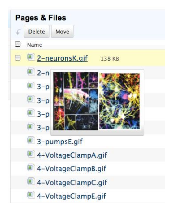
Figure 1. The wiki's list of uploaded illustrations, showing the scheme for creating order by naming each image file with the number of the lecture, its general topic, and a letter for the specific file. Mousing over a filename displayed a thumbnail of the figure.

Mousing over a filename in the list showed a thumbnail of the figure (Fig. 1).