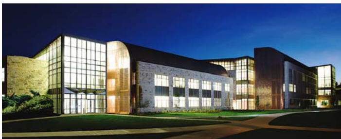
Figure 1. Regents Hall of Natural and Mathematical Sciences.

The design process was driven by a programmatic vision that we packaged into our "Seven I's." Throughout design, we continuously asked whether Regents Hall