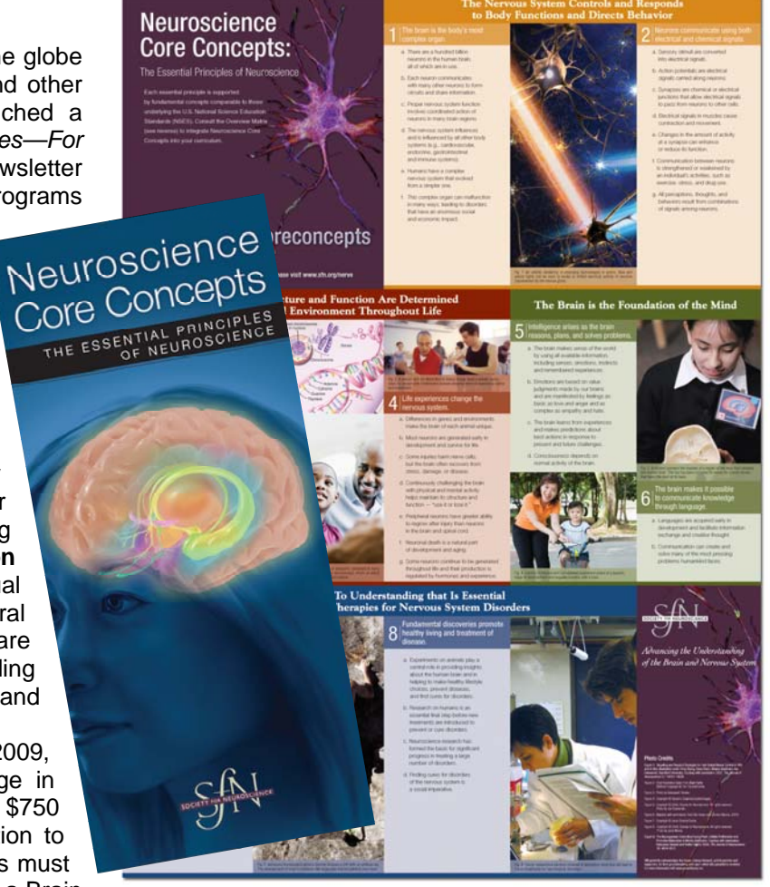
Figure 2. Neuroscience Core Concepts

A product of 18 months of intensive development led by PECC and robust collaboration of numerous stakeholders, Neuroscience Core Concepts offers the most important insights gained through decades of brain research. The new tool includes a glossary of common neuroscience terms and basic anatomical diagrams, and provides educators in the United States with a correlation to science education standards. The Neuroscience Core Concepts is a living document that will be updated as the field evolves and new information emerges. Copies of the pamphlet are available for free and as a downloadable PDF file