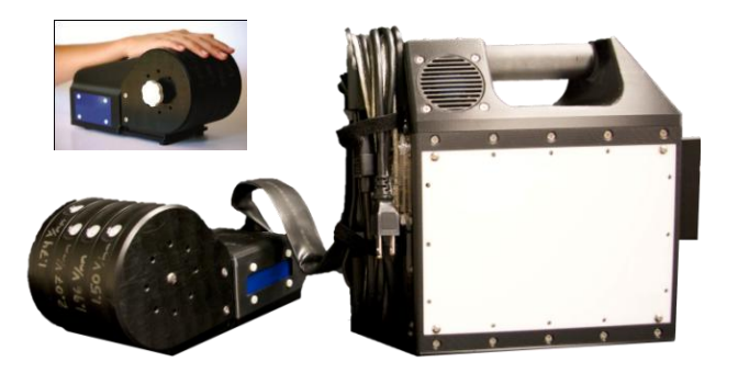
Figure 1. Cortical Metrics (CM-4) Stimulator. INSET: Subject's hand properly positioned on the stimulator.

computers were networked together to allow centralized data storage in the Cortical Metrics Neurosensory Diagnostics Database. This allowed for instant on-line data analysis at the end of the exercise.