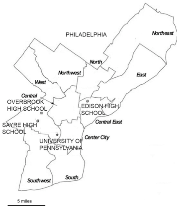
Figure 1. Map of Philadelphia showing the University of Pennsylvania and the high schools that have participated in the Pipeline Neuroscience Program: Overbrook, Edison, and Sayre. (Reprinted with permission from Hamilton et al., 2007.)

The number of high school students enrolled annually has ranged from 25 to 46. According to 2005-2006 data from the School District of Philadelphia, 77.8% of Edison students are Latino and 19.3% are African American. The student bodies at Sayre and Overbrook are 98.5% and 98.8% African American, respectively. Additionally, 84.5% of Edison students, 61.7% of Sayre students, and 70.7% of Overbrook students were eligible for the Federal School Lunch Program in the 2005-2006 school year (School District of Philadelphia, 2006). The demographics of students participating in the program closely reflect those of their home schools. For example, in 2007, 100% of the 26 participating high school students from Sayre were African American. There were 24 sophomores, one junior, and one senior. Overbrook and Edison high schools did not participate in 2007 because University of Pennsylvania administrators focused on building its partnership with Sayre, where a dedicated science teacher has championed the program. The Pipeline program counts towards a Philadelphia Unified School District requirement that students participate in activities that are of civic value.