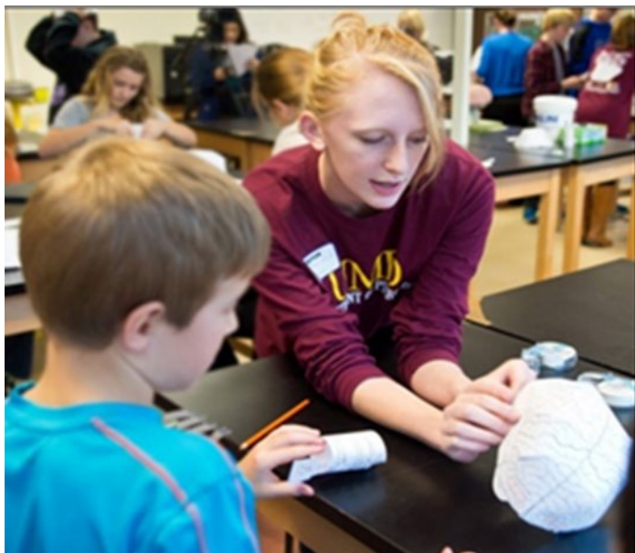
Figure 1. University students “learning through teaching”.

2019). The Mobile Neuroscience Lab contains equipment from Backyard Brains (2022), including Spikerboxes, along with sheep brains (Carolina Biological, 2021), play dough, paper brain caps (Teacher Enrichment Initiatives/CAINE, 2009), plastic human brain models (Samsco®), electrophysiology recording caps (Electro-cap International, Inc.), and iWorx – (HK-TA Human Physiology Teaching Kits). Sufficient equipment was purchased to allow for use in classroom group activities (i.e., 4-6 students/ group).