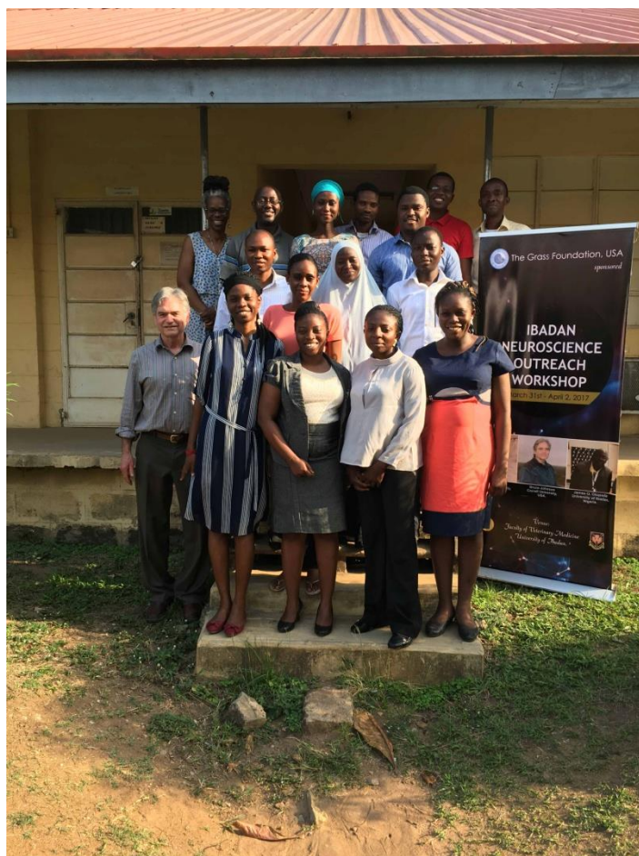
Figure 2. Faculty facilitators and participants in the 2017 Ibadan/Grass Foundation Neurophysiology Workshop.

We continued the next morning with a recapitulation of the previous day's lectures and answered participants' questions that arose over night. The rest of the morning and early afternoon (with breaks) was devoted to the use of BYB amplifiers for student laboratory exercises, with participants working in pairs (Figure 4). We used the SpikerBox package to record extracellular action potentials from the classic cockroach leg mechanoreceptive afferent preparation (Linder and Palka, 1992; Ramos et al., 2007; see BYB: https://backyardbrains.com/experiments/somatotopy ), and smartphones to visualize the electrical signals from the different preparations. The use of the smartphones proved to be a wise choice for data visualization because there were