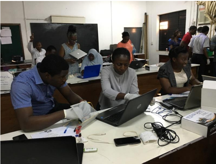
Figure 4. Participants at work in the 2017 Ibadan/ Grass Foundation Neurophysiology Workshop.

channel SpikerBox amplifiers, participants were able to estimate giant axon conduction velocity. This exercise was followed by recording of human EMGs with Muscle SpikerBoxes. All the cockroaches and earthworms used in the lab exercises were gathered from the surrounding outdoor area by Prof. Olopade's lab assistants.