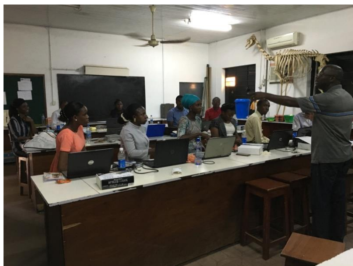
Figure 3. Professor James Olopade lecturing to participants in the 2017 Ibadan/Grass Foundation Neurophysiology Workshop.

problems getting Windows based laptops to interface properly with the SpikerBox output.