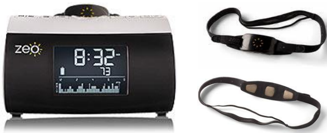
Figure 1. Left: Photo of the ZEO® Personal Sleep Coach bedside unit display with docked wireless headband. Right: Outside and Inside view of the wireless headband (Zeo, Inc., n.d.).

The ZEO® Personal Sleep Coach, records EEG activity from the frontal cortex using a headband with three soft, disposable electrodes (see Figure 1). The headband communicates wirelessly with a bedside unit that converts EEG patterns and reports sleep stages in 5-minute increments. Reported sleep parameters include: latency to sleep (Time to Z), total time in sleep (Total Z), number of awakenings (Number of Awakenings), time in wakefulness (Time in Wake), time in light sleep (Time in Light), time in deep sleep (Time in Deep), time in REM sleep (Time in REM) and ZQ score. ZQ score is a system-defined indicator of sleep quality that weights recorded parameters according to the formula: ZQ = 8.5 * (\text{Total Z}) + 0.5 * (\text{Time in REM}) + 1.5 * (\text{Time in Deep}) - 0.5 * (\text{Time in Wake}) - 0.07 * (\text{Number of Awakenings}) .