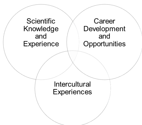
Figure 1. Global Learning in a Neuroscience Study Abroad Context.

increasingly specialized, a student whose ultimate trajectory is a career in research needs to develop an understanding of working collaboratively. In a progressively interconnected world these collaborations need not be limited to partner institutions down the road, or by the boundaries of countries. Rather they can be driven by scientific inquiry and identification of appropriate partners who are leaders in the field. Undergraduate study abroad begins to foster this recognition early in a student's research career and may ideally expand their career options. As a typical career in neuroscience can stretch from undergraduate, to graduate, to post-doc, to employment, it is often a nomadic endeavor within a highly competitive discipline. A study abroad experience can be an enormous step towards widening a student's 'familiar' geographic region.