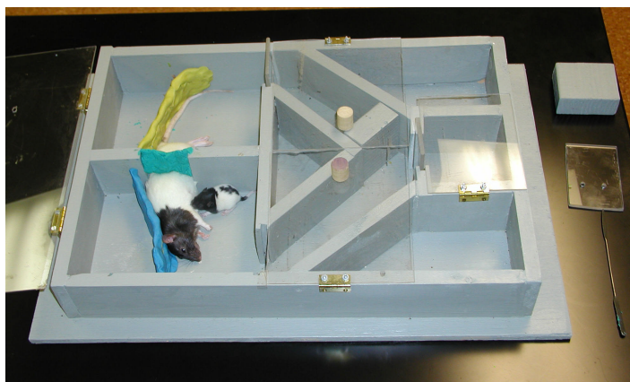
Figure 1. Photograph of Y-maze. Note hinged Plexiglas lids for each maze section. These can be taped down during adaptation. Holes are drilled in lid over goal area (raised in this picture) for air circulation.

have essentially nowhere else to explore and nothing to distract them from nipple attaching.